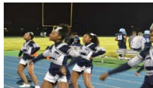
Varsity Cheerleaders revving up the crowd and cheering the boys on to victory.