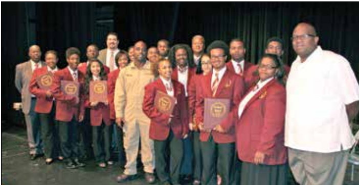
Board Members, District Administrators and Student Board Members at Teacher Institute Day.