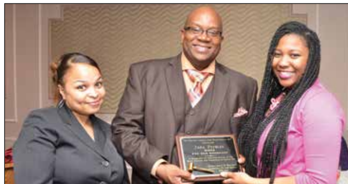
Board Secretary and Board President present award to Student Board member.