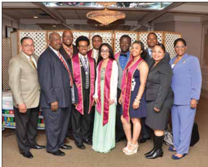
Board Members, Interim Superintendent and dignitaries at annual Senior Student Board Ceremony.