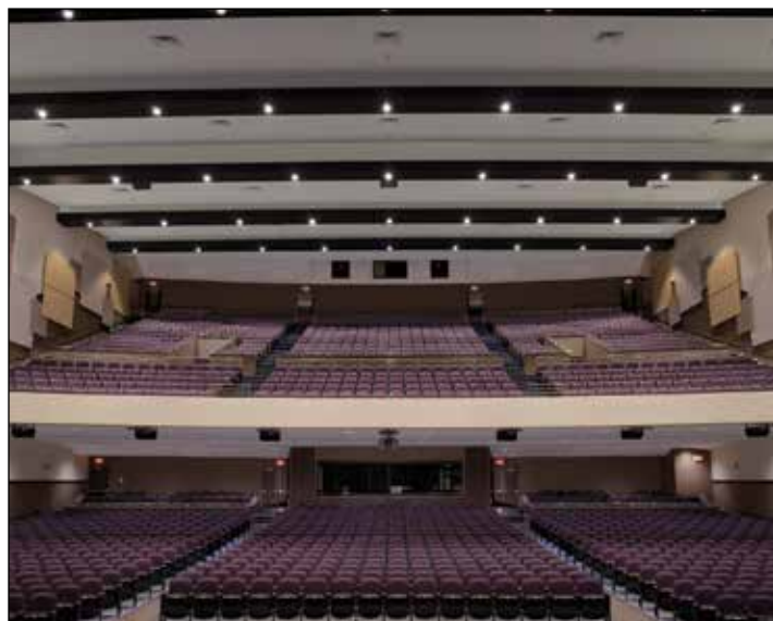
Thornton's Renovated Auditorium