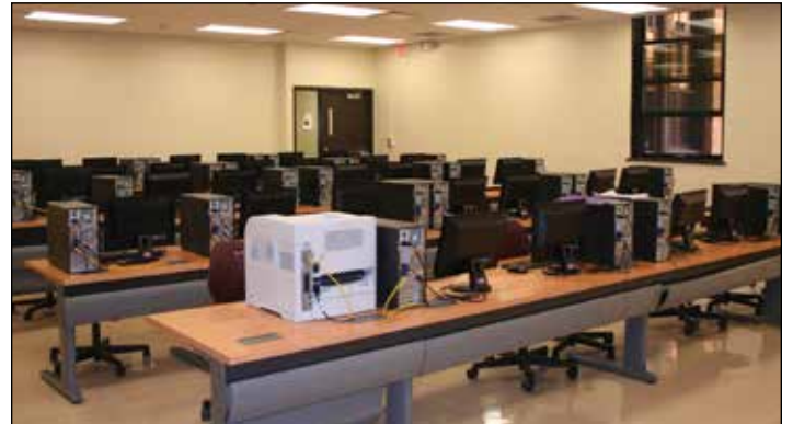
Renovated Computer Labs

The Board of Education is committed to providing a state of the art facility so our students are equipped to become competitive leaders in our global society.