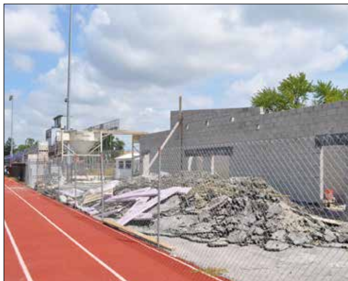
Under Construction Concession Stands