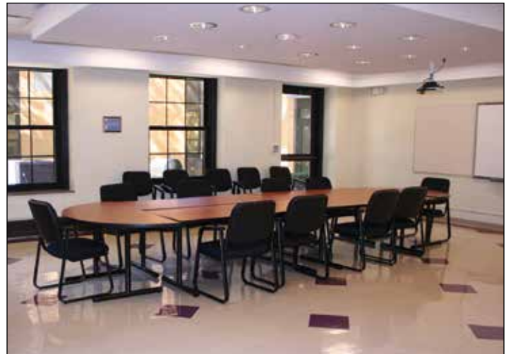
New Multi-Purpose Room