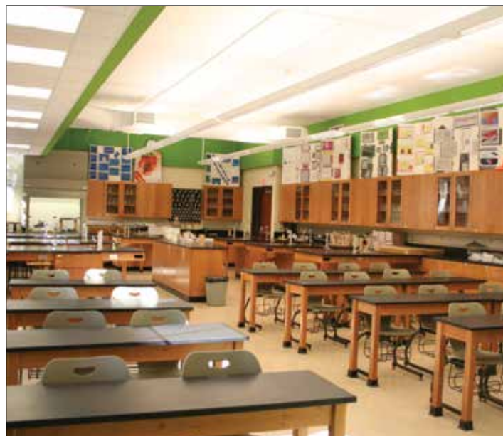
New Science Labs

We know that strong community support is critical to building and sustaining a world class school district. The Board of Education invites the community to experience the district first-hand by visiting our schools and monitoring the District 205 website – www.district205.net .